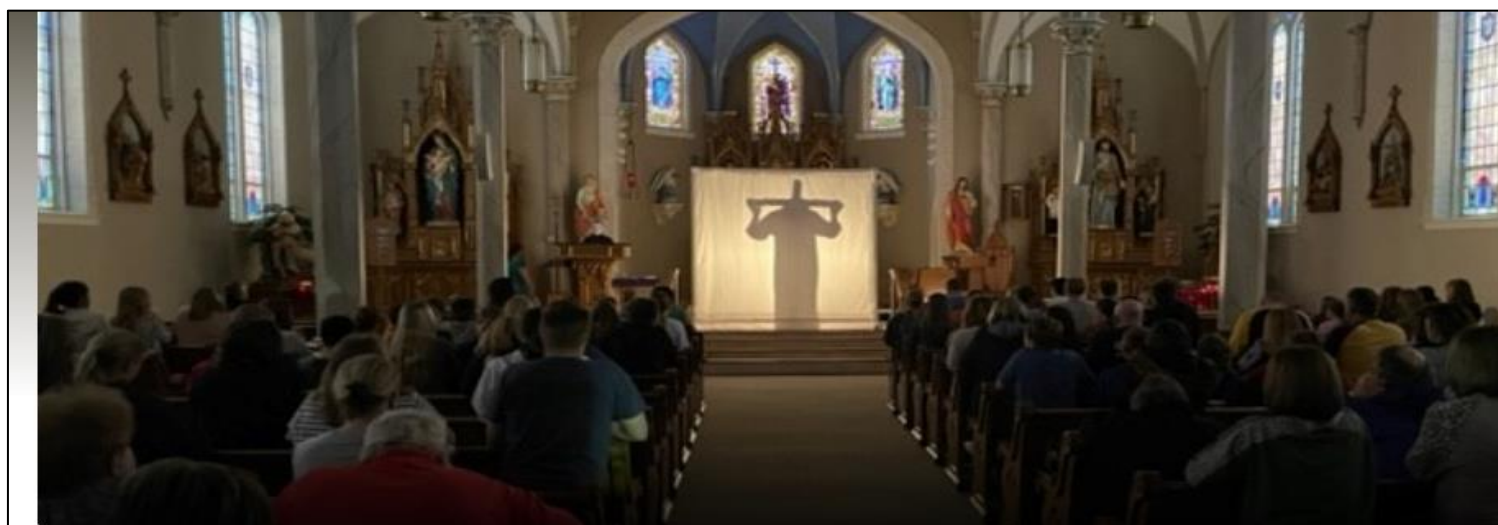
St. Anthony / St. Lawrence Catholic Churches

SEE INSERT for Holy Week Stewardship Schedule Or Find Schedule and Us on Facebook https://www.facebook.com