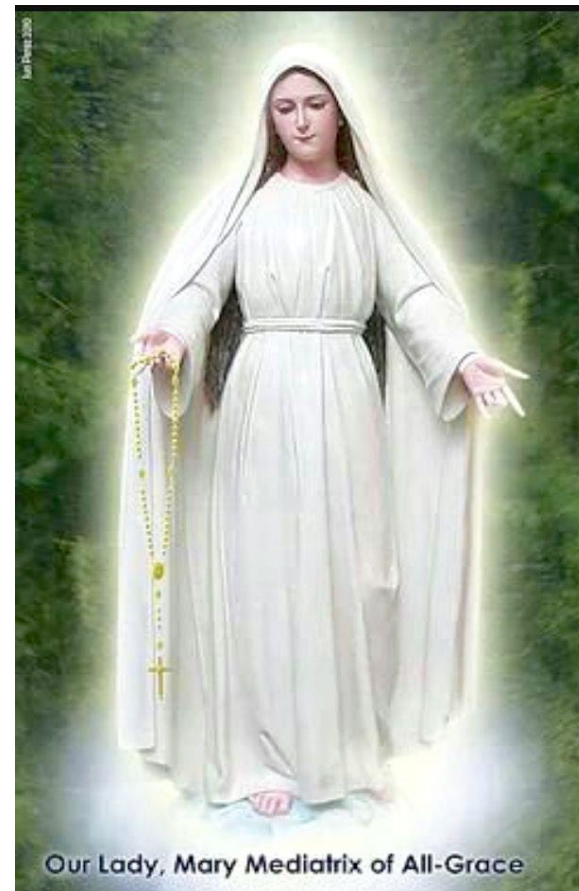
Our Lady, Mary Mediatrix of All-Grace